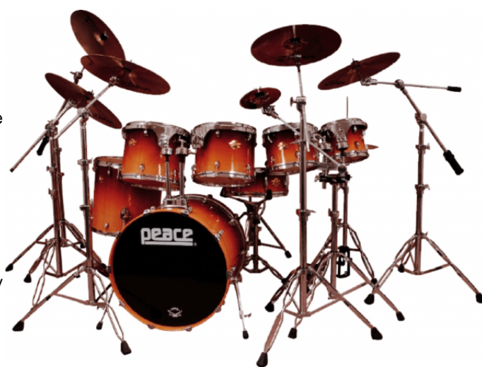
Immagine indicativa: Disponibile solo con tom sospesi

Peace's top-of-the-line package kit, the DNA series resides at the crossroads of rugged and handsome, where professional quality meets affordability. A versatile kit designed to capture the quintessential modern drum set sound, the DNA series combines heavy duty series 800 hardware including both a straight and a boom stand, and 9-ply lacquered North American maple drums in a package that includes rims-mount toms, low-mass lugs, die-cast claws, and brass vents, among many stand-out features. The series is offered with chrome or black-trim hardware, and custom sizes and finishes are also available by special order. It ain't broke, so we didn't fix it. Peace's DNA series has been a preferred choice by artists and endorsers for years, and it's been heralded as "a pro-level kit at a very affordable price" by DRUM! Magazine. Shown in one of Peace's new finishes, black castle, a three color sparkle lacquer finish with a triple sparkle overlay belt that explodes chords of color under stage lighting.