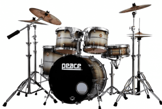
Immagine indicativa: disponibile solo con tom sospesi

Peace's top-of-the-line package kit, the DNA series resides at the crossroads of rugged and handsome, where professional quality meets affordability. A versatile kit designed to capture the quintessential modern drum set sound, the DNA series combines heavy duty series 800 hardware including both a straight and a boom stand, and 9-ply lacquered North American maple drums in a package that includes rims-mount toms, low-mass lugs, die-cast claws, and brass vents, among many stand-out features. The series is offered with chrome or black-trim hardware, and custom sizes and finishes are also available by special order. It ain't broke, so we didn't fix it. Peace's DNA series has been a preferred choice by artists and endorsers for years, and it's been heralded as "a pro-level kit at a very affordable price" by DRUM! Magazine. Shown in one of Peace's new finishes, black castle, a three color sparkle lacquer finish with a triple sparkle overlay belt that explodes chords of color under stage lighting.